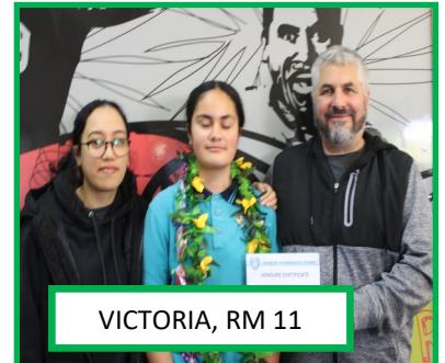
VICTORIA, RM 11