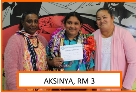
AKSINYA, RM 3