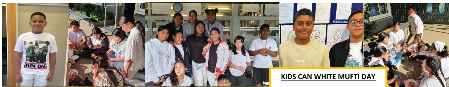
KIDS CAN WHITE MUFTI DAY