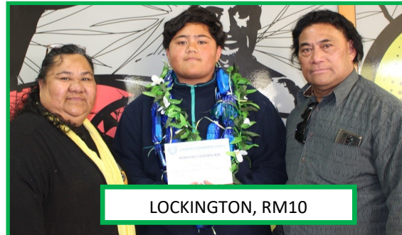
LOCKINGTON, RM 10