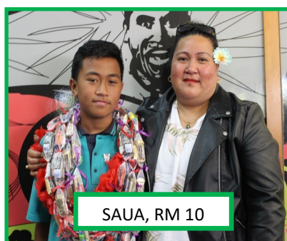
SAUA, RM 10