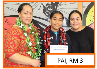
PAI, RM 3