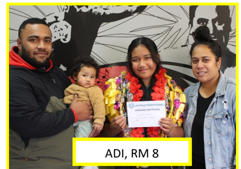
ADI, RM 8