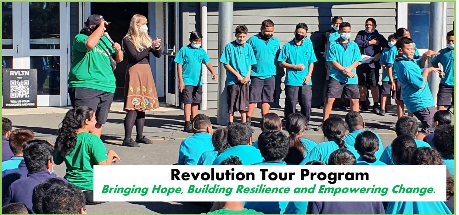
Revolution Tour Program Bringing Hope, Building Resilience and Empowering Change.